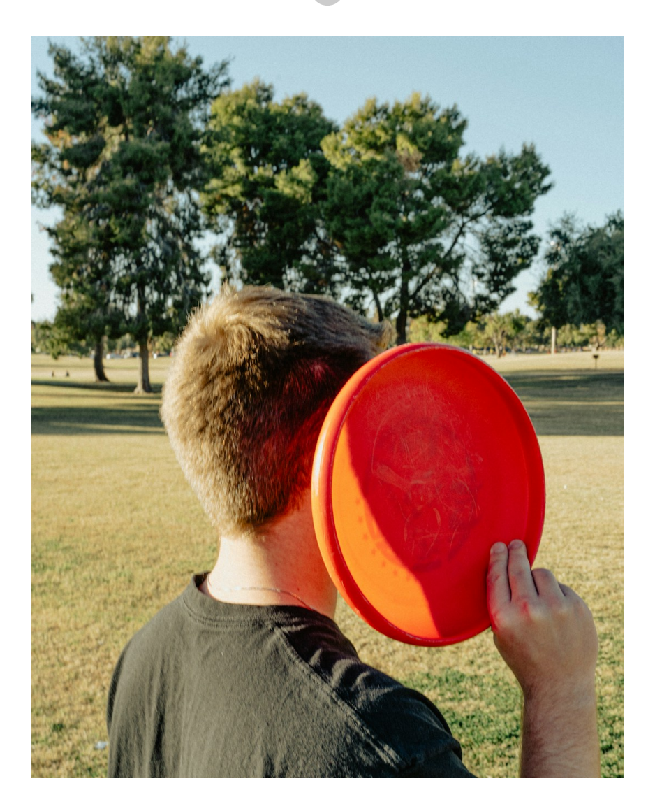
What is he throwing?