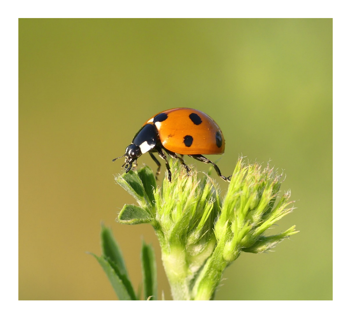
What type of insect is this?