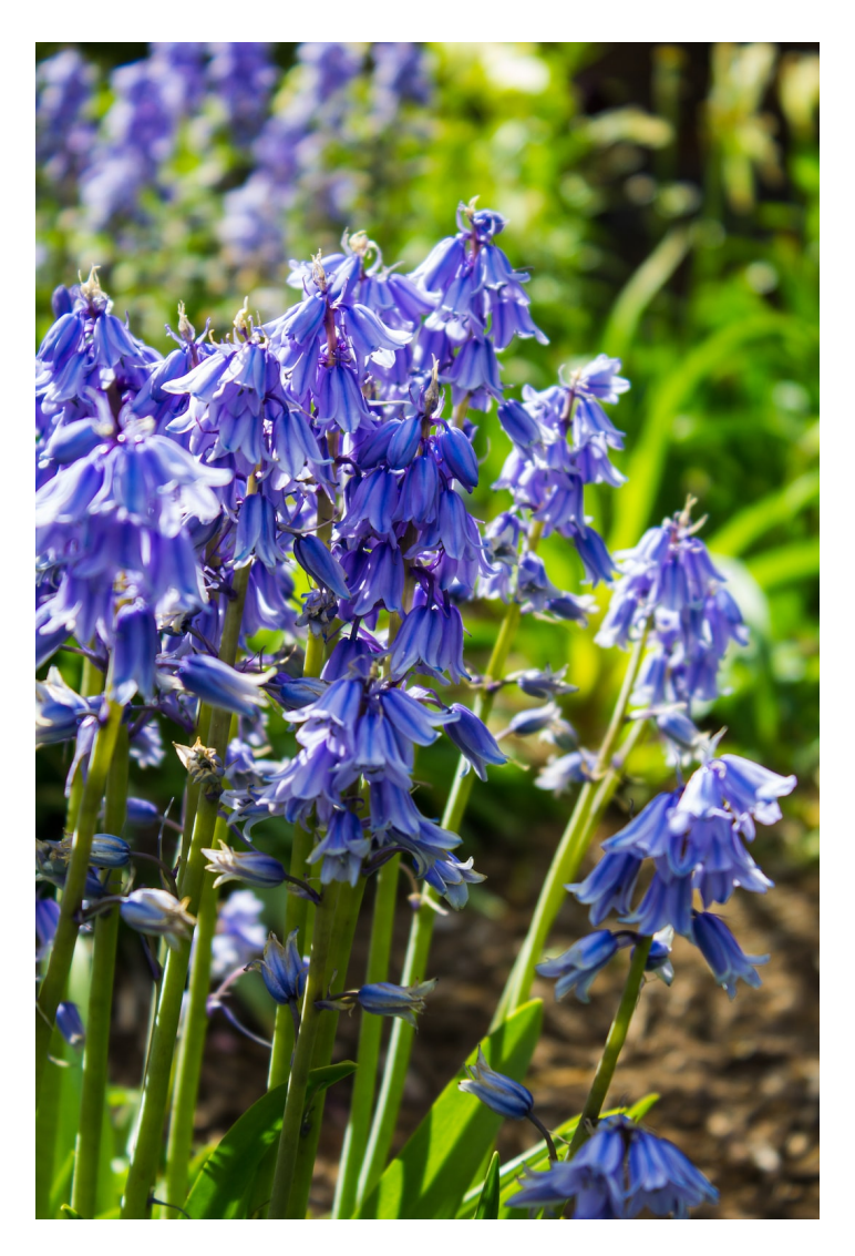
What kind of flower is this?