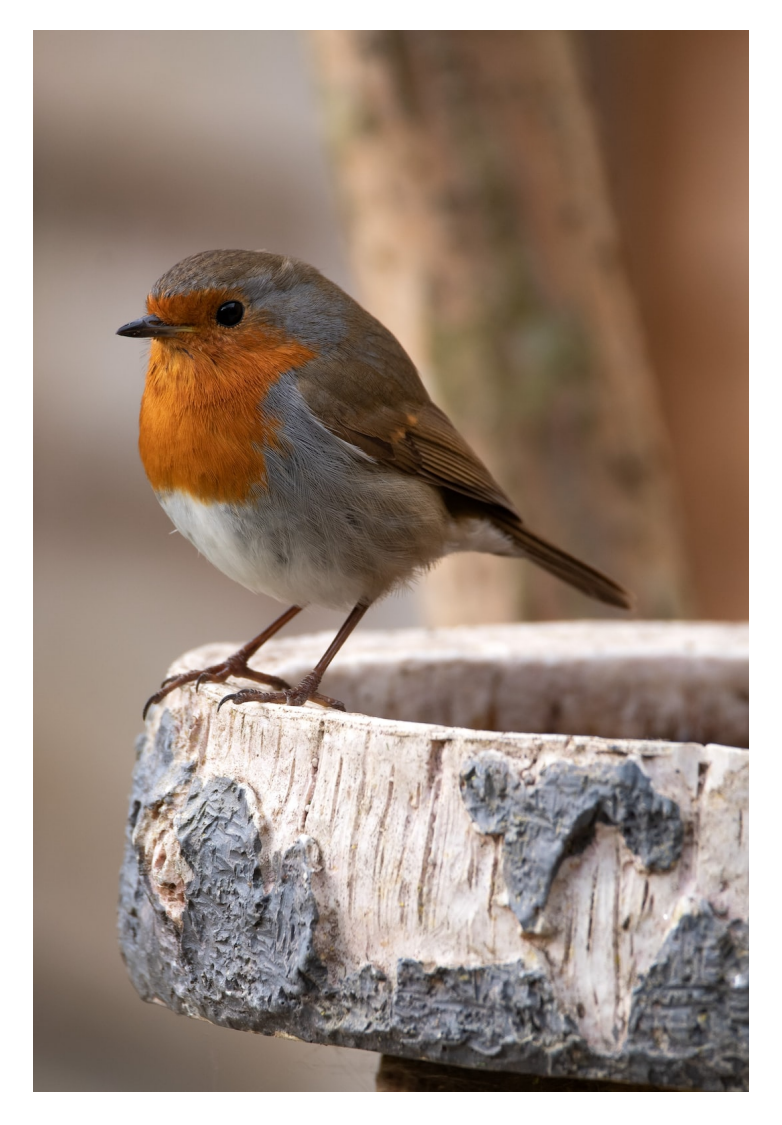
What kind of bird is this?