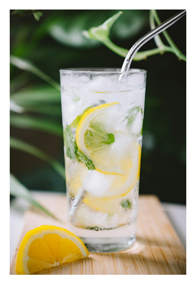
What is this drink?