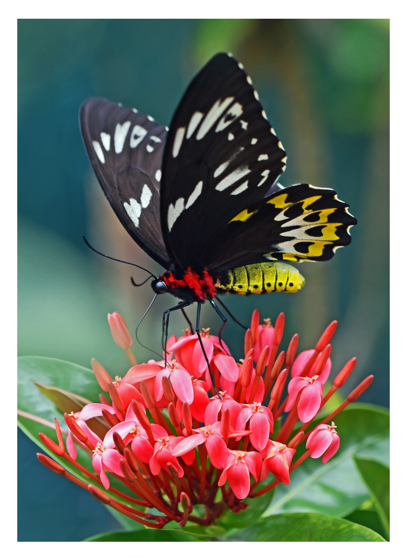
What kind of insect is this?